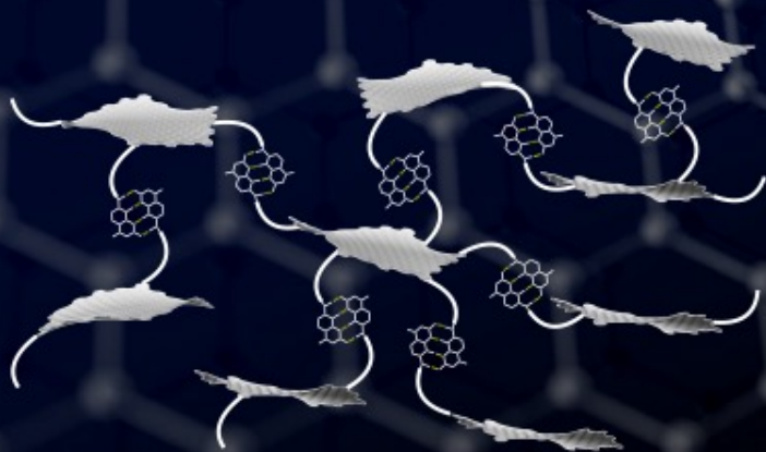
Graphene networks directed by designed supramolecular interactions